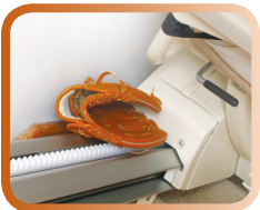
Safety sensors on carriage and footrest stop the lift instantly at obstacles.

As with all Pinnacle stair lifts, the HD model is engineered to the highest industry standards and designed for optimal comfort, convenience and aesthetics.